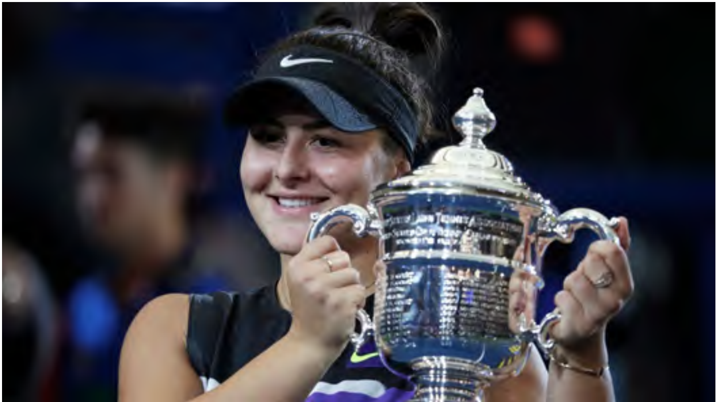
Bianca Andreescu, of Canada, holds up the championship trophy after defeating Serena Williams, of the United States, in the women's singles final of the U.S. Open tennis championships Saturday, Sept. 7, 2019, in New York.